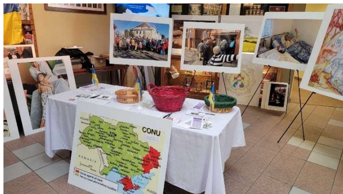
Figure 3. Setup for parishioners in the Holy Apostles vestibule

After Mass, CONU representatives provided more details about current initiatives and entertained questions from parishioners. Brochures were distributed to provide more information including links to CONU's website. Between the second collection at all masses and online donations the result was nearly $20,000. Jesus is most definitely in the hearts of the Holy Apostles' parishioners.