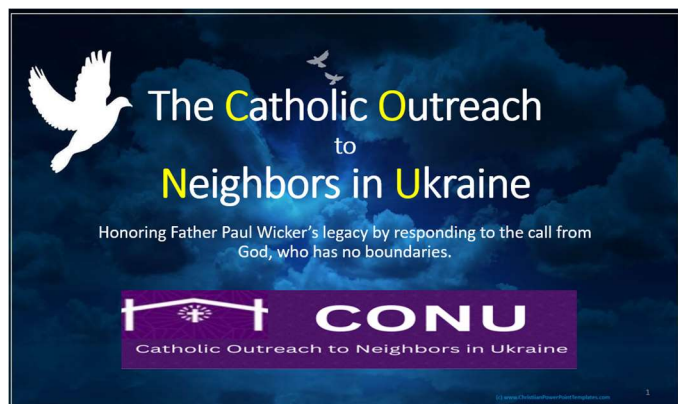
Figure 2. Holy Apostles parishioners receive awareness presentation