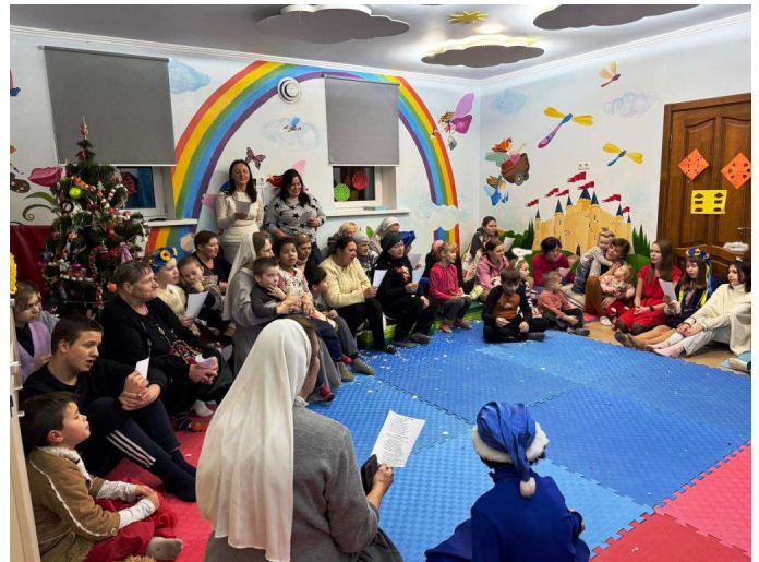
Figure 4. The staff, mothers, and children gather for a Christmas celebration at the House of Hope

Mark 9:36-37: Taking a child, He set him before them, and taking him in His arms, He said to them, "Whoever receives one like this in My name receives Me; and whoever receives Me does not receive Me, but Him who sent Me."